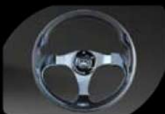
Luxury steering wheel