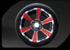
14"Alum Wheel Radial DOT Tire