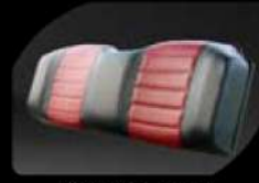
Two tone seat