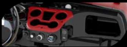
Color matched Dash with four cup holders/cell phone holder